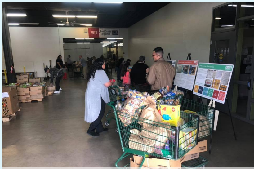
Living Streets Alliance pop-up engagement at the Community Food Bank of Southern Arizona