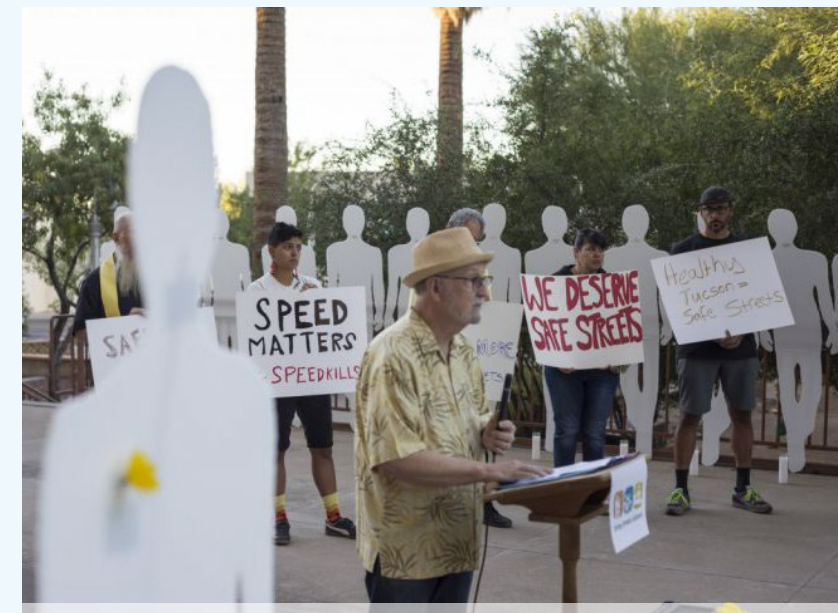
Living Streets Alliance World Day of Remembrance for Road Traffic Victims 2017