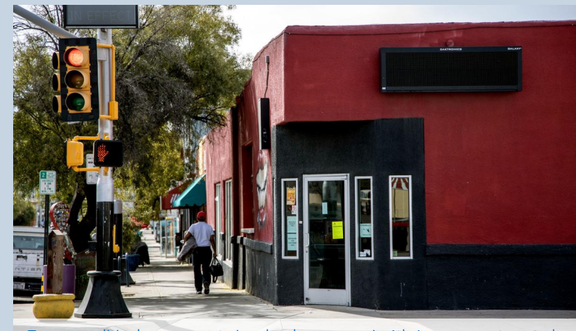
Tucson coalition's agreement gives locals more say in 4th Avenue apartment plan